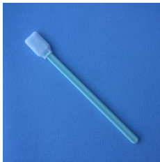
CSW.B.PRE / CSW.B.FIN

The cleaning swabs are suitable for hand cleaning of optical elements with the OXAPA Cleaner HRM 04 and can be used for all kinds of crystals and glasses after polishing as well as before and after coating.