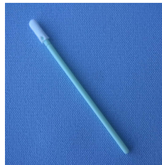
CSW.N.PRE / CSW.N.FIN